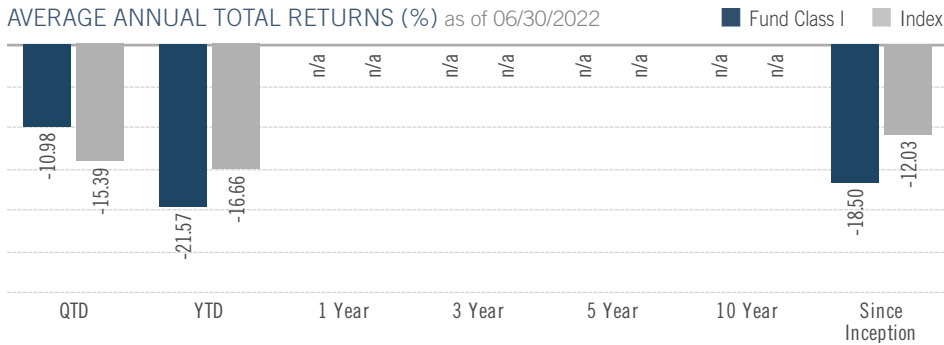
AVERAGE ANNUAL TOTAL RETURNS (%) as of 06/30/2022

Performance data quoted represents past performance. Past performance does not guarantee future results. Investment return and principal value will fluctuate so that shares, when redeemed, may be worth more or less than their original cost. Current performance may be lower or higher than the performance data quoted. Please visit virtus.com for performance data current to the most recent month end. This share class has no sales charges and is not available to all investors. Other share classes have sales charges. See virtus.com for details.